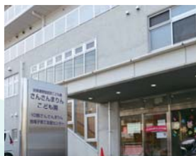
Sun Sun Marine Center for Early Childhood Education and Care