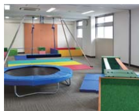
Child Development Support Center Marine