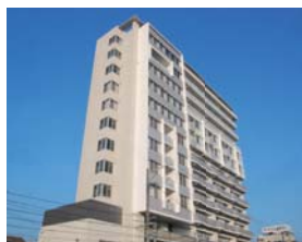
Sunrise Marine Seto

Care House Living Assistance for Specified Facility Residents Day Service Home Nursing Care Assistance