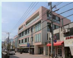
Sun Sun Minato Nursery School