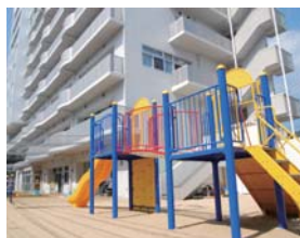
Sun Sun Marine Community Parenting Support Center